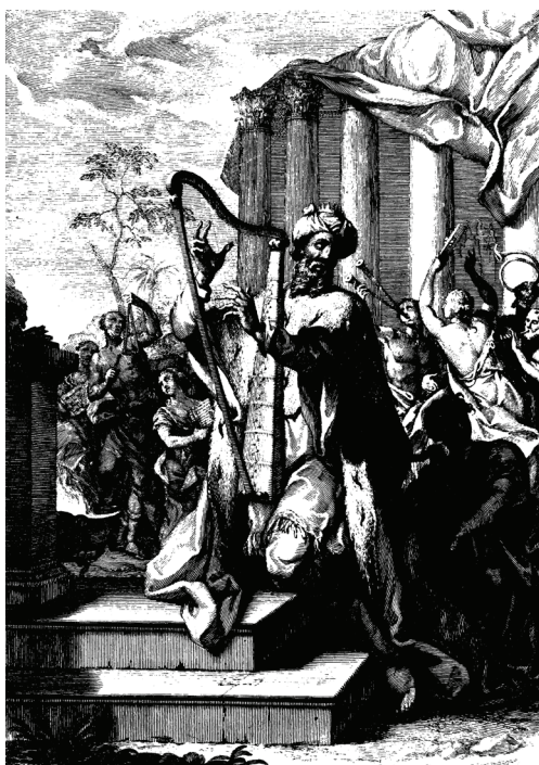
Illustration 1: Giuseppe Camerata's depiction of songs of praise provided by King David (Books 1 and 5 of the Salmi di Davide ).